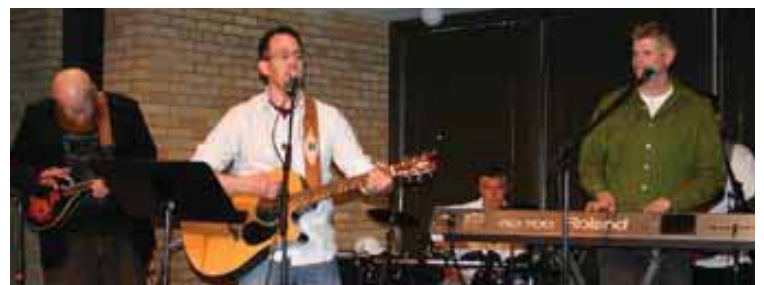
Eyewitness performs during an "evening of soul food."